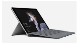
Surface Pro X