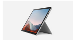
Surface Go 2